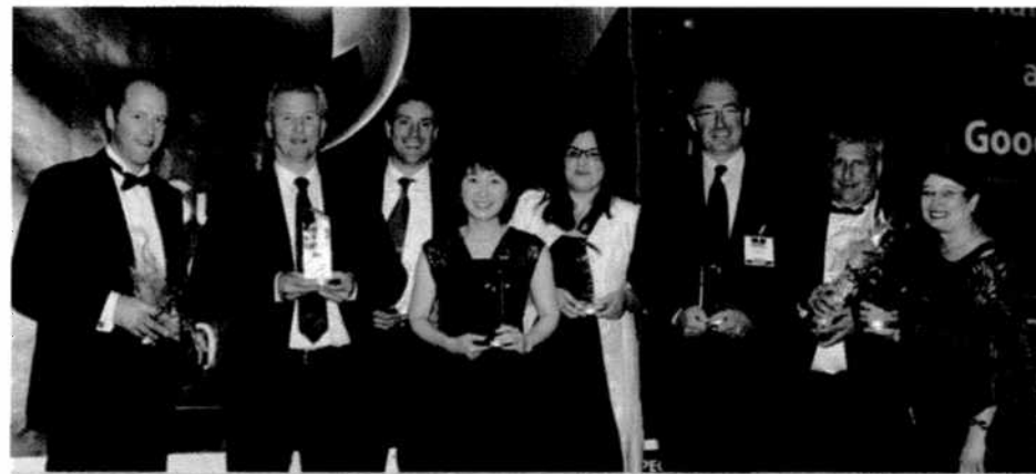
All the award winners on stage at this year's Supply Chain Distinction Awards.

providers and over 50 exhibitors. The event also featured a series of dynamic one-to-one meetings, enabling delegates to highlight a business strategy moving forward by either meeting with fellow delegates in a private networking environment or by taking pre-arranged meetings with leading vendors.